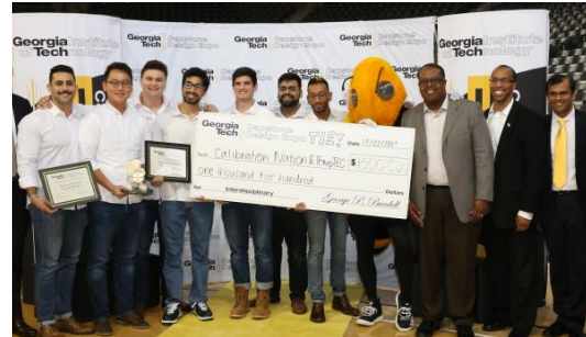
Fig. 2. CREATE-X Capstone Design team winning Best Interdisciplinary award at the Capstone Exposition, Fall 2019.

At the end of the semester, CREATE-X Capstone design teams present their work at the university-wide exposition. CREATE-X teams were 4.5 times more likely to win awards at the exposition as compared to the population of all teams. CREATE-X teams have won awards including: Best Interdisciplinary (Fig. 2) and Best Mechanical in both Spring 2019 and Fall 2019. This shows an external validation of the success of this approach to the capstone course as teams are judged alongside all other Georgia Tech capstone projects by external visitors including corporate executives.